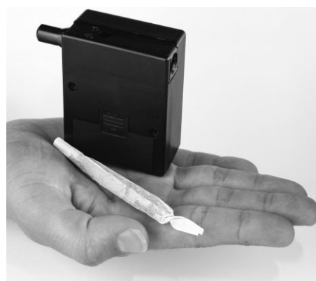
Figure 1 Topography measurement device

Finally, to investigate whether cannabis smoking topography is a predictor of cannabis dependence severity independent from other exposure determinants,